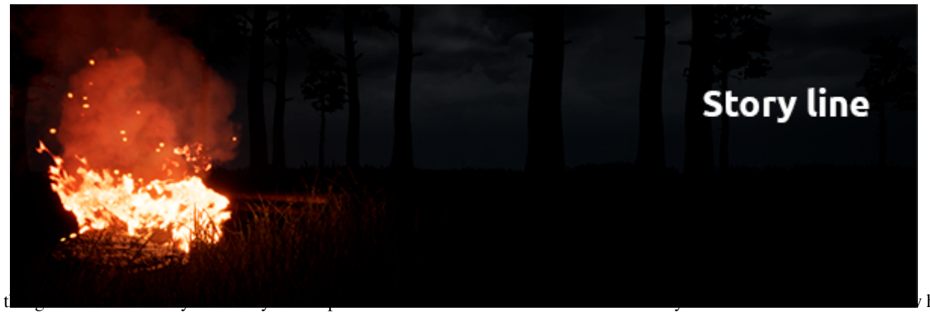
feels. You can only safely say that he is not comfortable and even scared. Only the darkness surrounding him, strange sounds, seclusion from oneself - all this only aggravates the situation. But that does not happen, he should answer himself to a few questions: